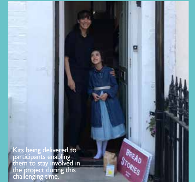
Kits being delivered to participants enabling them to stay involved in the project during this challenging time.