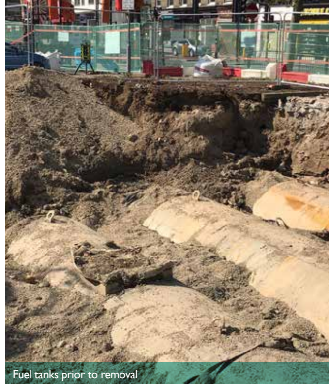
Fuel tanks prior to removal