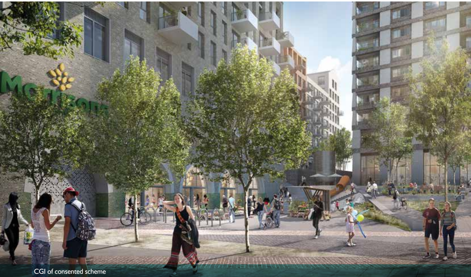
CGI of consented scheme

Welcome to our second newsletter, providing you with all the latest news about St George and Morrisons' partnership to regenerate the Camden Goods Yard site.