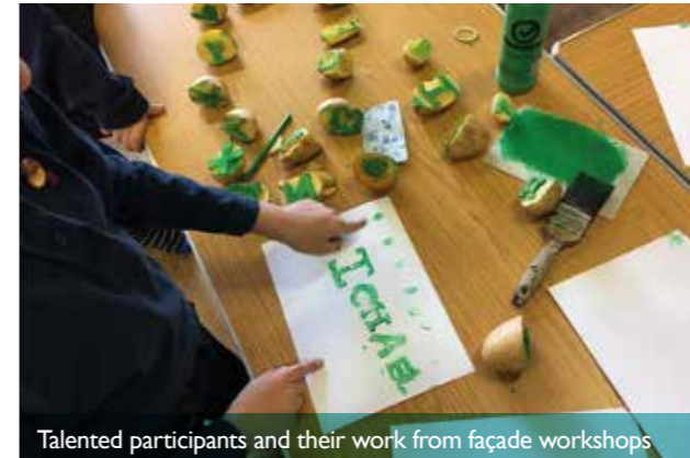
Talented participants and their work from façade workshops