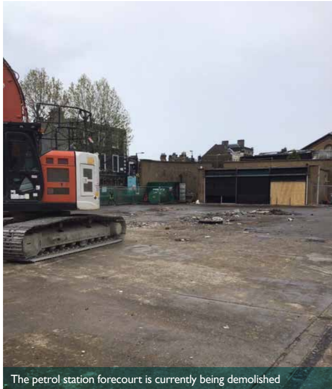
The petrol station forecourt is currently being demolished

Should you wish to be part of these meetings going forward, and have received no previous correspondence from us, please email feedback@camdengoodsyard.com or call 0800 298 7040 , leaving your name and number.