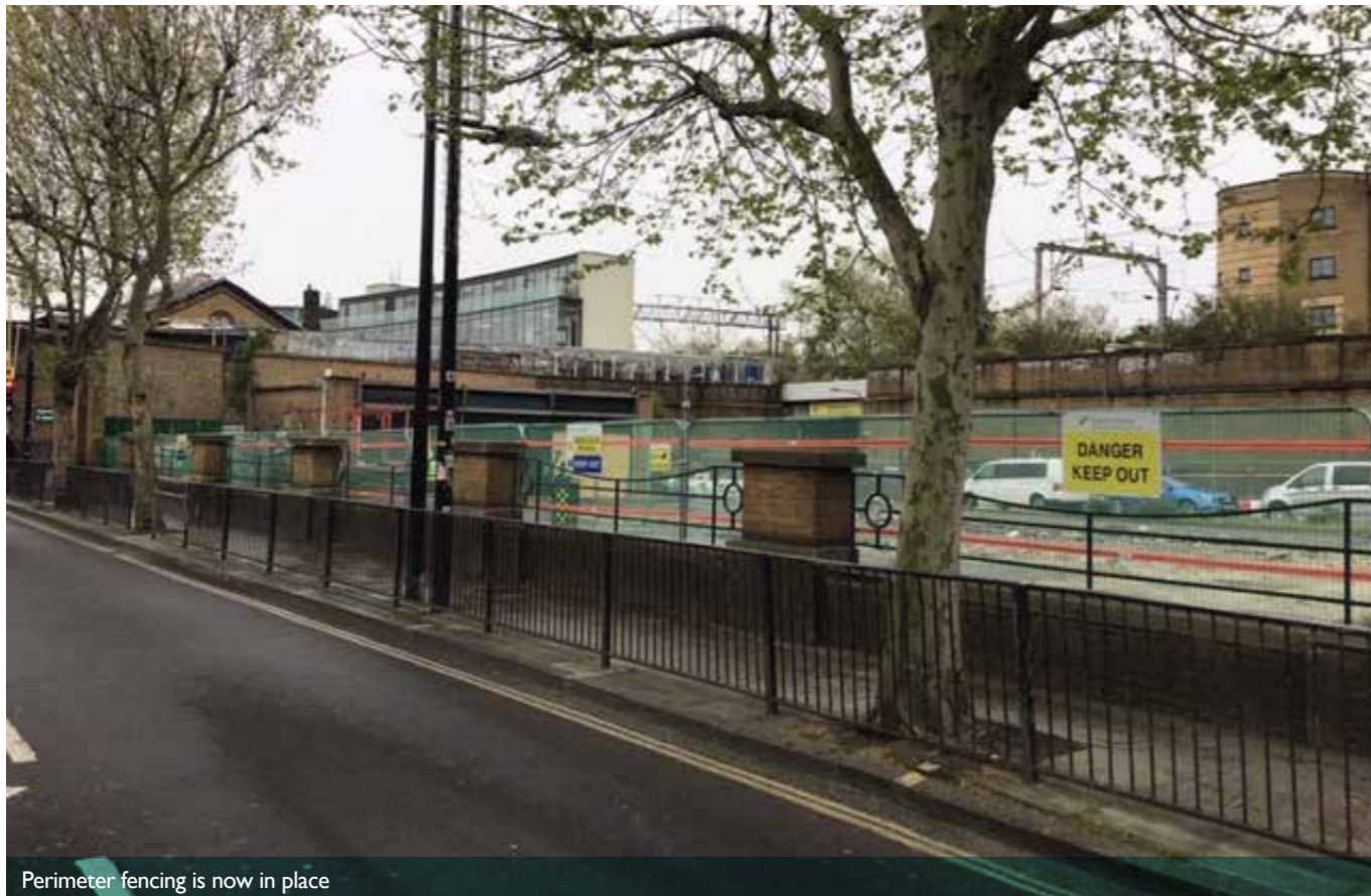
Perimeter fencing is now in place